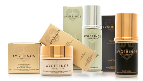
Face Full Set 10210662